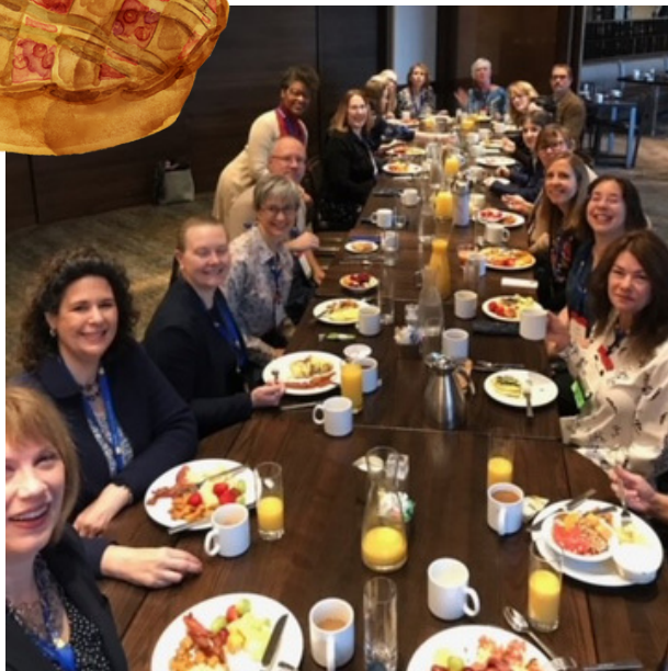
BELS Member Breakfast at AMWA