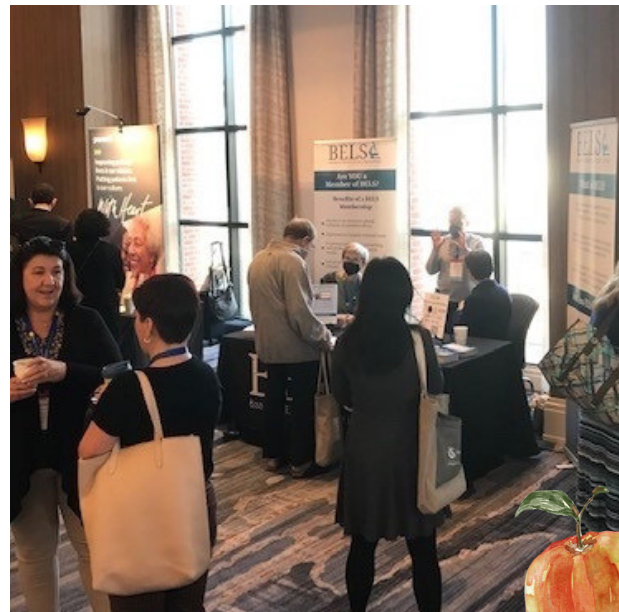
BELS Booth at AMWA