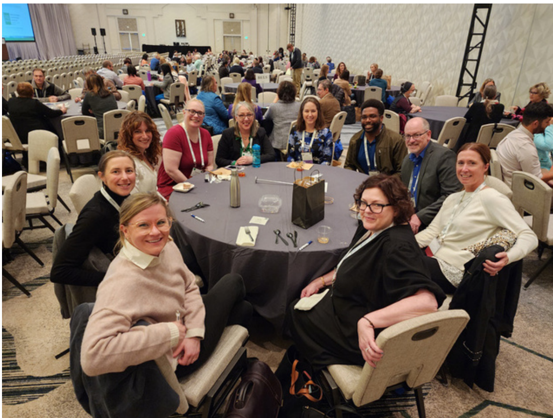
BELS members at the AMWA conference