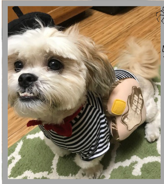
“French toast, anyone?” ~ Luther (Corey Astrom’s shih tzu)